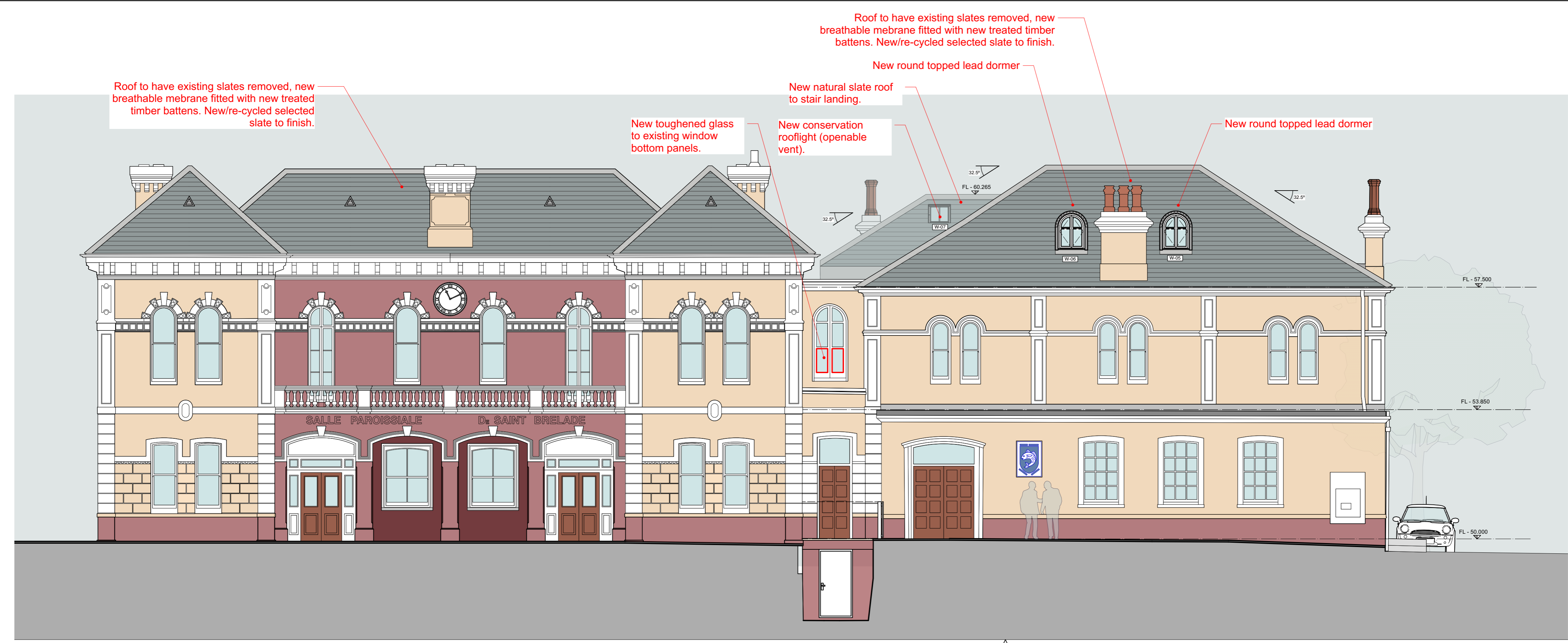
5 South Elevation Scale: 1:75

Datum = 47.000m St Brelade's Parish Hall PS1220-102-1