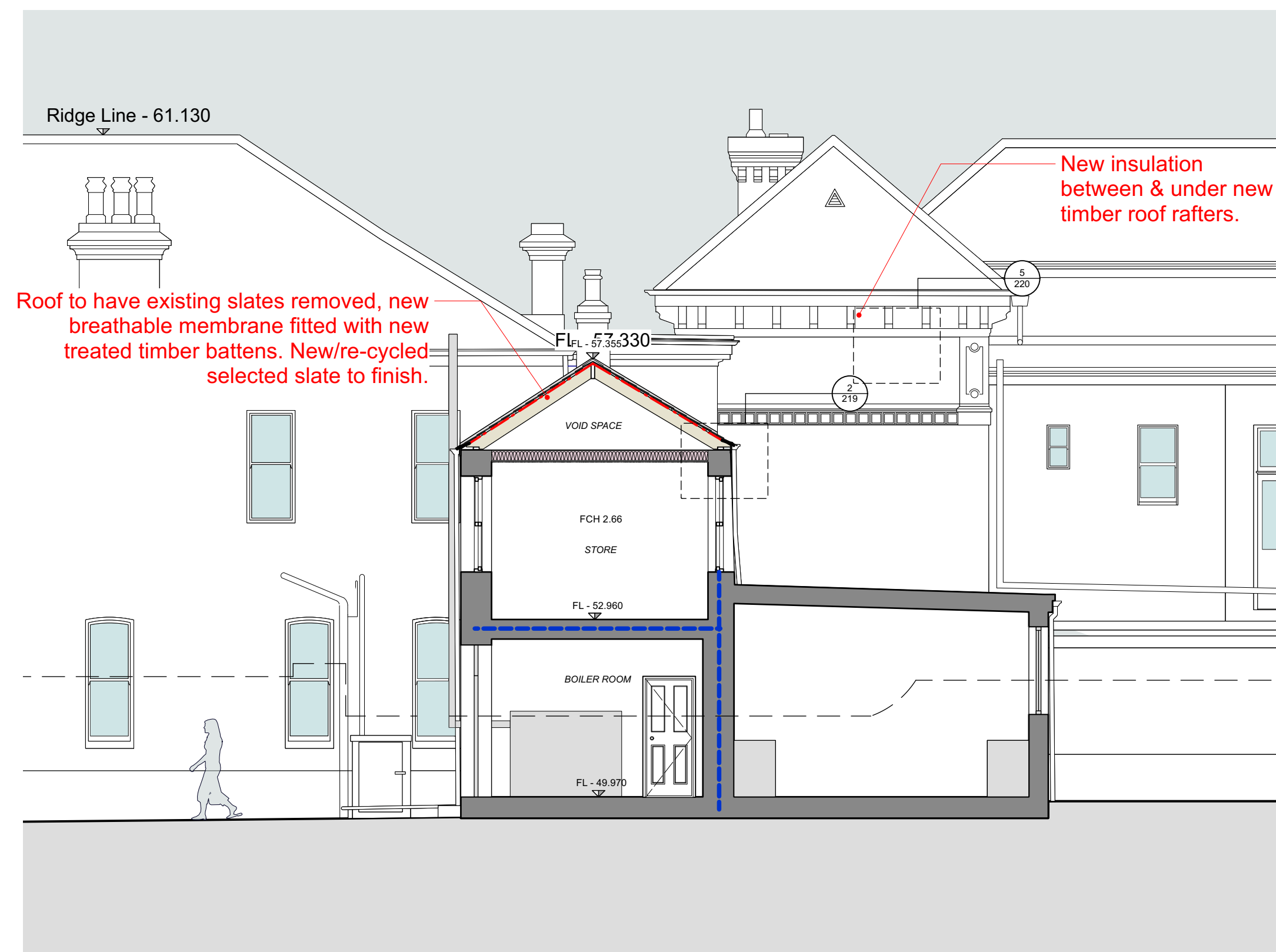
3 Proposed Section F-F Scale: 1:75