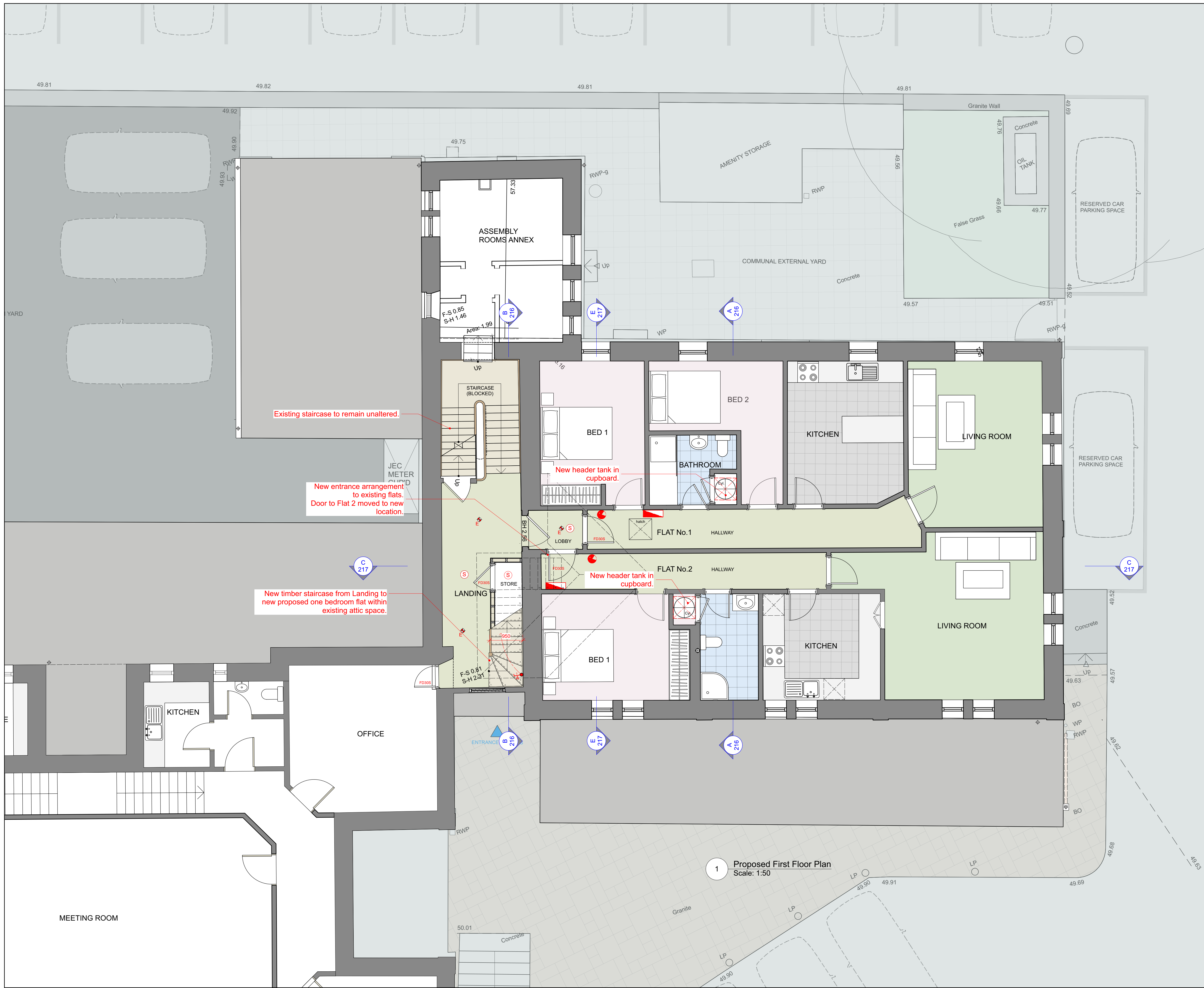
1 Proposed First Floor Plan Scale: 1:50

GENERAL NOTES: This drawing must not be copied in whole or in part without prior written permission of Riva Architects Limited. This drawing must be read in conjunction with other architects drawings & all schedules (Building Bye-Law check list and with all relevant structural engineering drawings, details and specifications. It is the contractor's responsibility to ensure that all work is carried out in accordance with all statutory requirements and to the approval of the building control officer (B.C.O.). The contractor is responsible for the setting out of the works. Any discrepancy found between this drawing and any other architect's detail drawing, schedule and/or specification must be reported to the architect before the work is carried out. Do not scale from this drawing. Refer only to written dimensions. All dimensions must be checked on site. The relevant British Standards for materials and their uses are to be adhered to. Manufacturers installation & fitting instructions must be obtained and adhered to at all times.