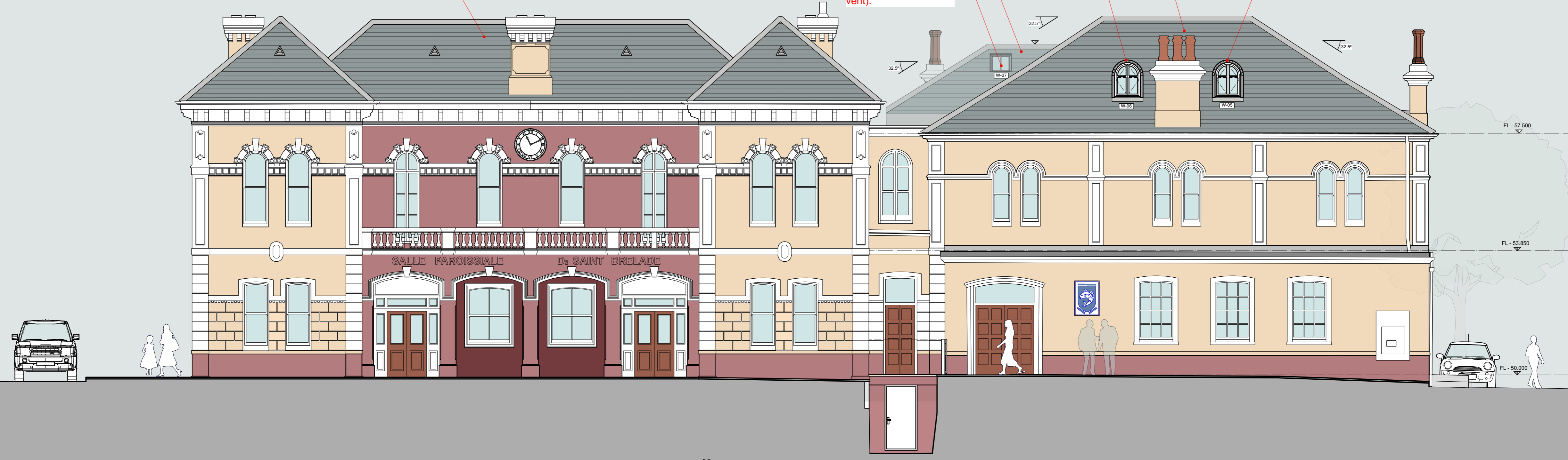
1 South Elevation Scale: 1:75

Roof to have existing slates removed, new breathable mebrane fitted with new treated timber battens. New/re-cycled selected slate to finish.